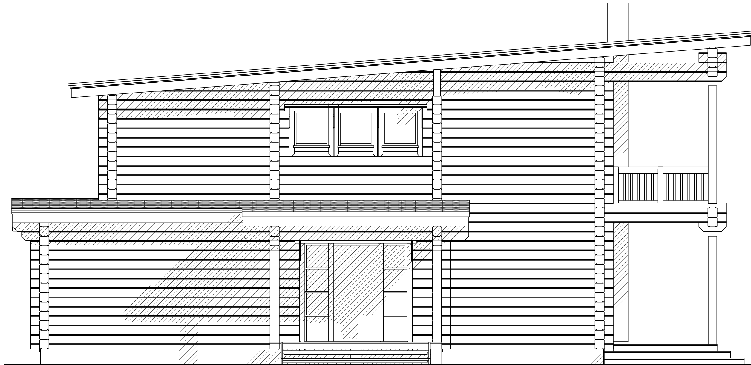
ELEVATIONS 1:50 PROJEKT TOMAS 05.02.2009