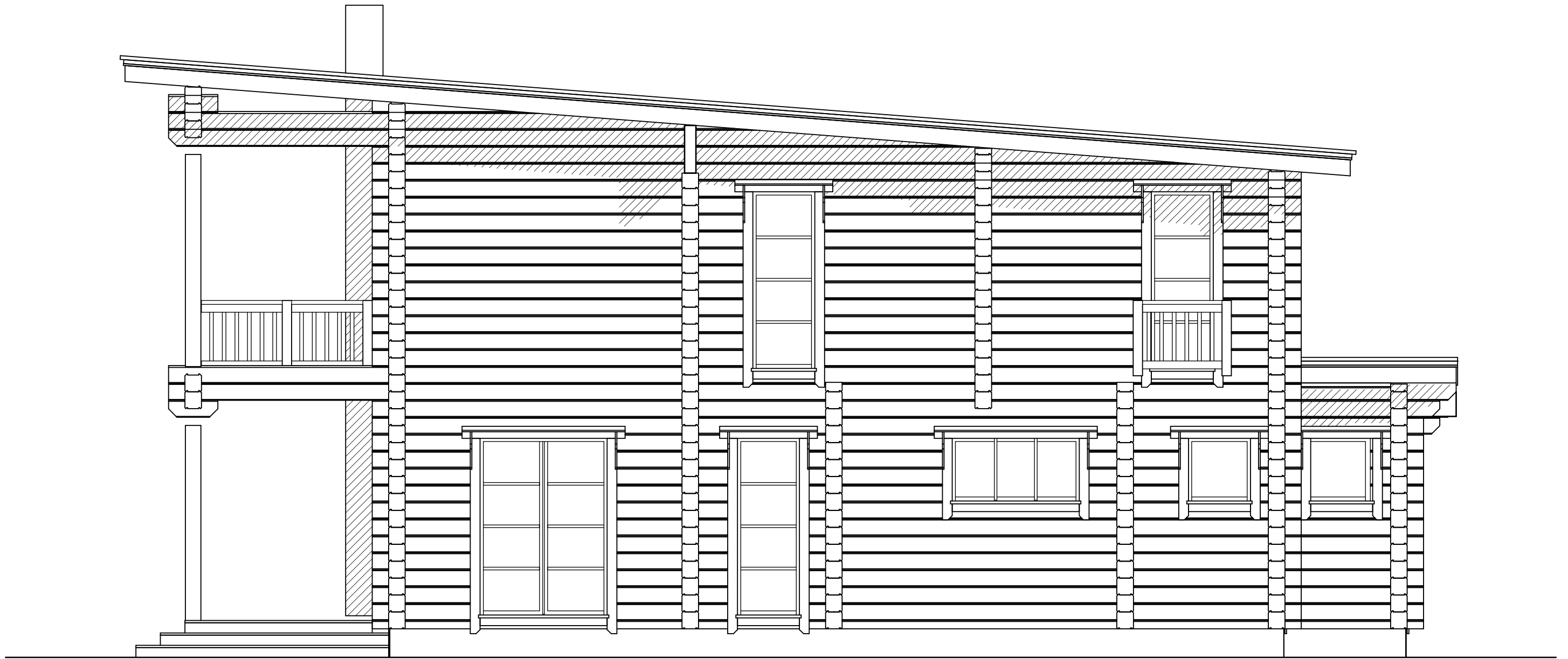
ELEVATIONS 1:50 PROJEKT TOMAS 05.02.2009